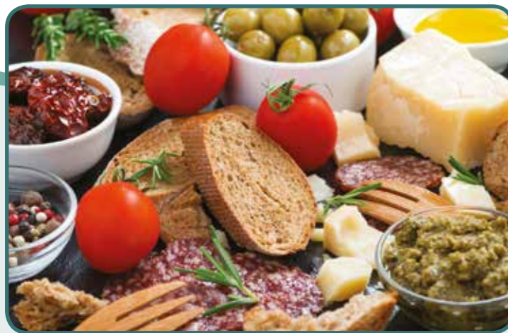
Source: Carni Sostenibili; FAO Sustainable Diets and Biodiversity: Directions and solutions for policy, research and action

As part of a Mediterranean diet that limits the consumption of meat to 650g per week, the CO2 emitted to obtain the recommended portions of animal protein is very close to the amount emitted to produce carbohydrates and vegetables eaten in a week. The environmental footprint of food is not only measured by CO2 emissions, therefore it is important to take into account other indicators as well. However, the environmental hourglass encourages a new approach, which assesses the impact of food on the basis of the amount actually consumed as part of healthy balanced diets.