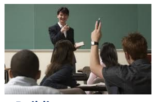
Building competence (training / learning)