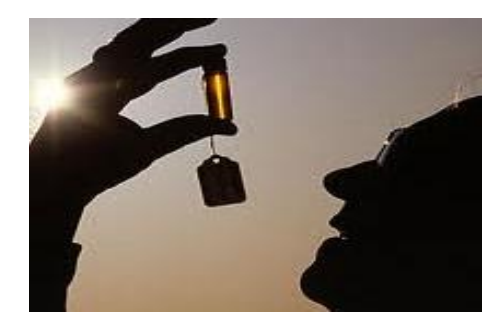
Finding new technologies that are acceptable to society