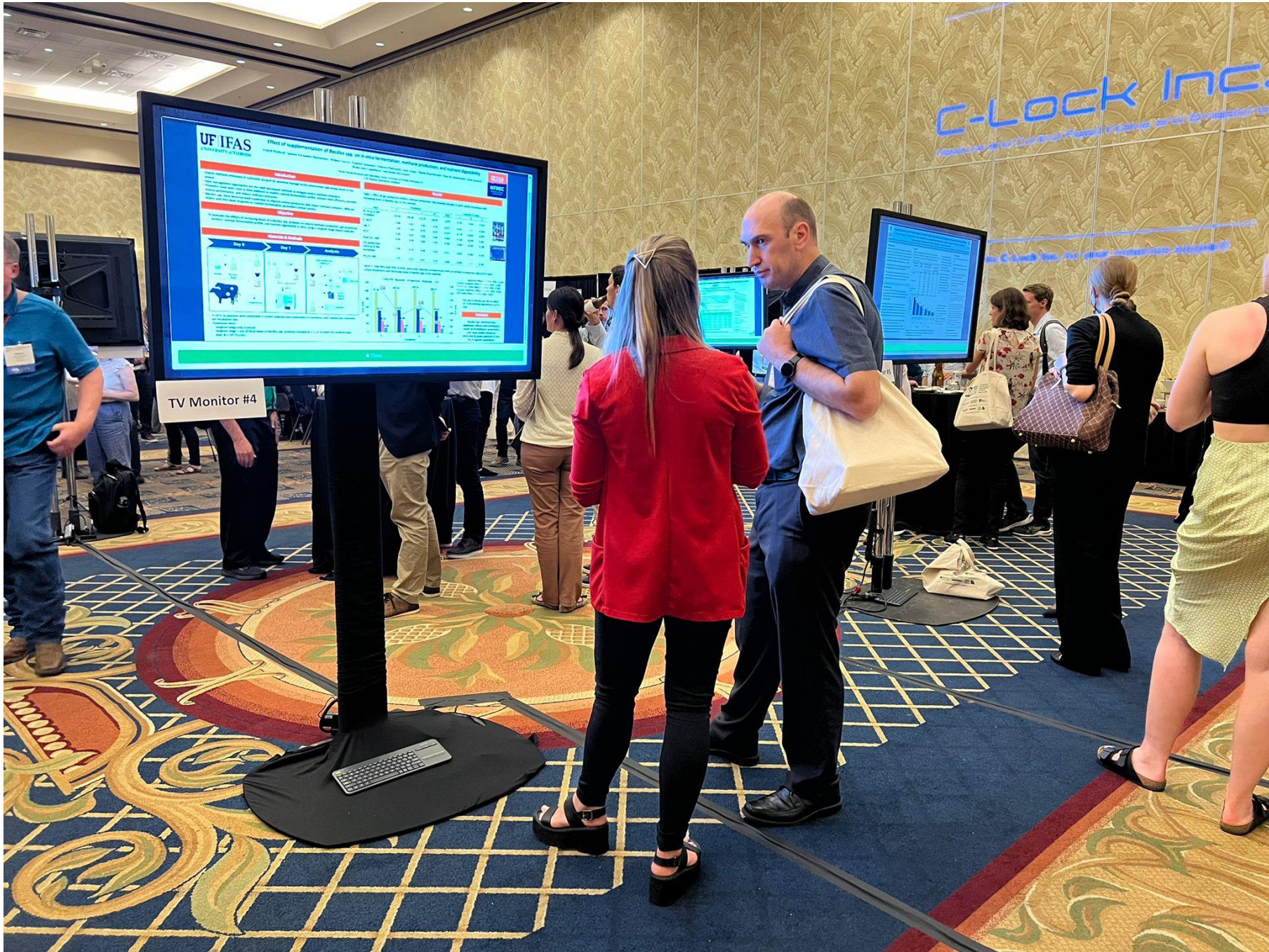
TV Monitor #4