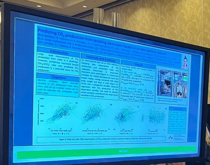
TV Monitor #4